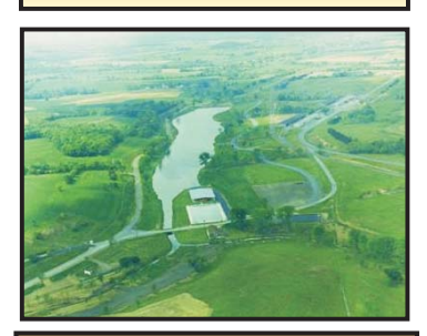
In September 1965, the facility's workmen begin removing trees and brush near Gate 16 to create a recreation area for all employees and their families. The construction consists of a pavilion, restrooms, playground and a spring fed pool