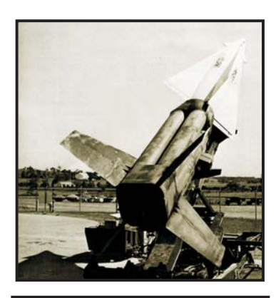
A Nike Missile, on display at Armed Forces Day, represents the immense workload with the Guided Missile Nike Maintenance mission.