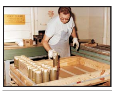
Ammunition and General Supply Divisions receive, store, dispose and ship guided missiles, ammunition and materiel.

The 60's were an enormous construction period as buildings were needed to change with the times. The Zero Defects program began in 1965. A Zero Defect Day, a depotwide rally - the first in depot history, was held on June 10th in building 2. All 5,000 employees were present. Each employee signed a pledge card and proudly wore their ZD pin as the U.S. Army Band played.