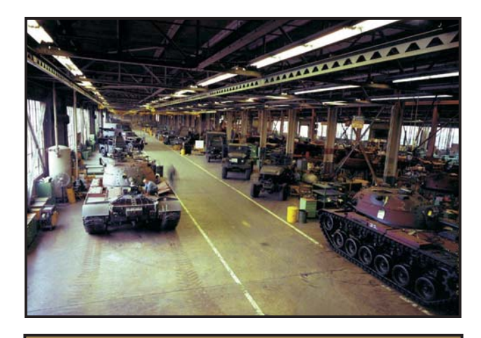
Letterkenny maintenance facilities' workload grows refurbishing tanks and wheeled vehicles in support of the Vietnam conflict.