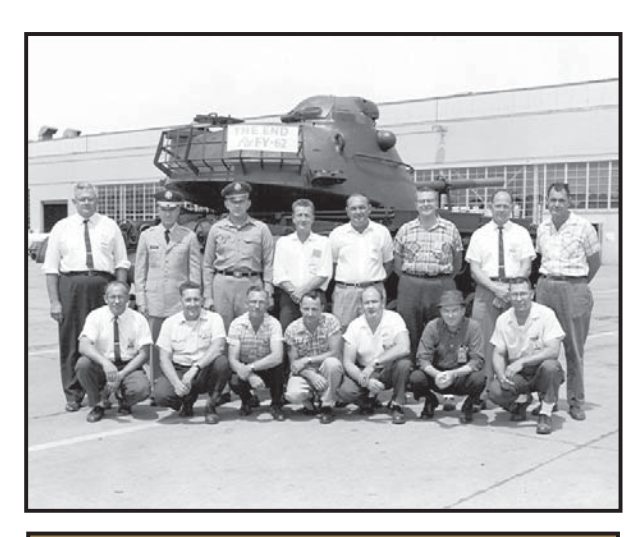
Letterkenny workers are often shown appreciation for their hard work with a group picture after the run of combat vehicles or the rollout of missiles.