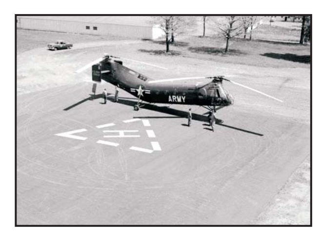
The depot has a new heliport as of June 1961, which is located to the rear of the Fire and Guard Building.